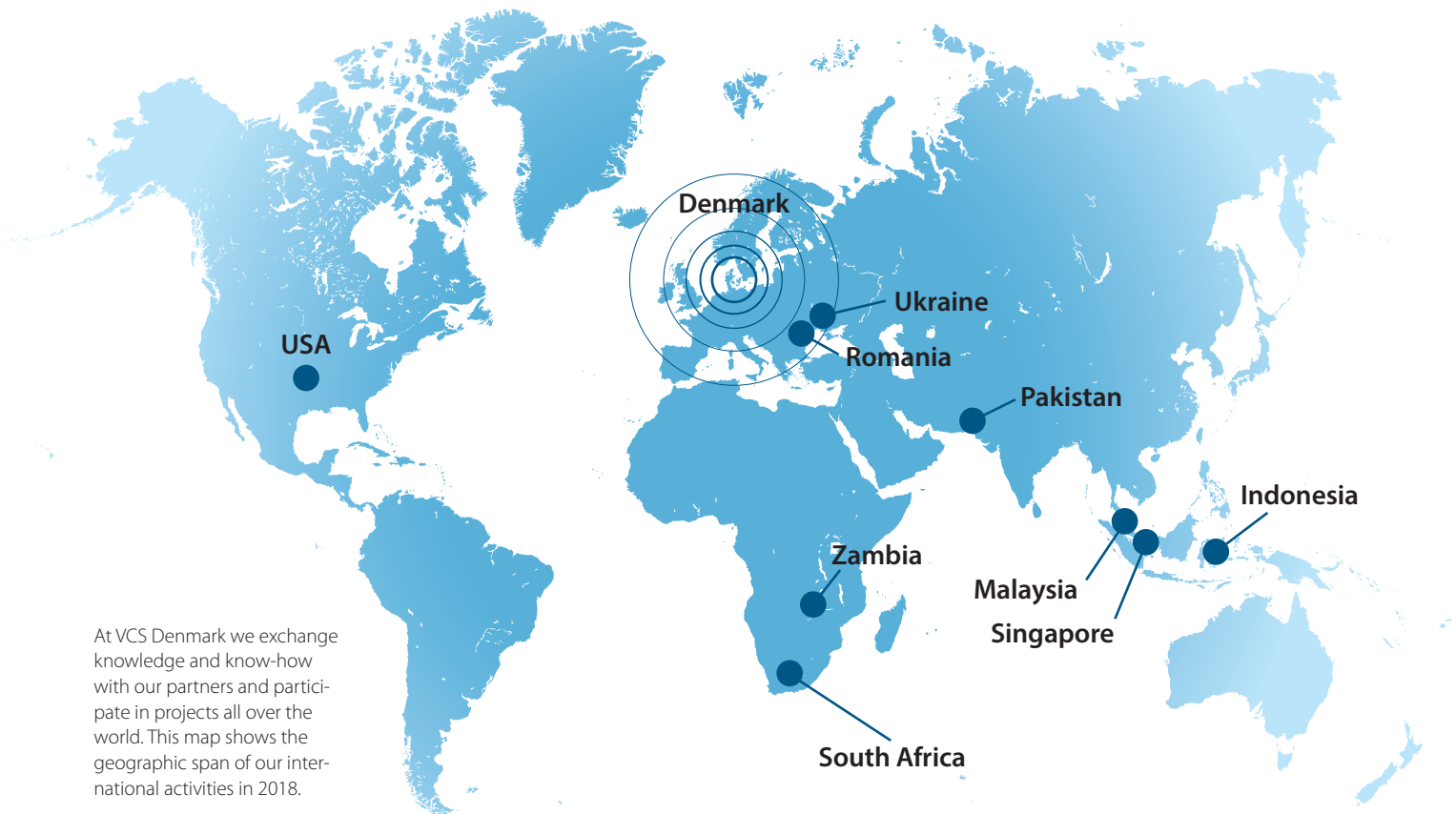
At VCS Denmark we exchange knowledge and know-how with our partners and participate in projects all over the world. This map shows the geographic span of our international activities in 2018.