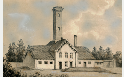
Odense Waterworks 1853.

have a special position where we are able to enter agreements and operate both on private company terms and as a publicly owned utility.